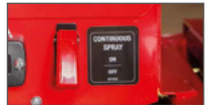
Continuous spray option for consistent application.