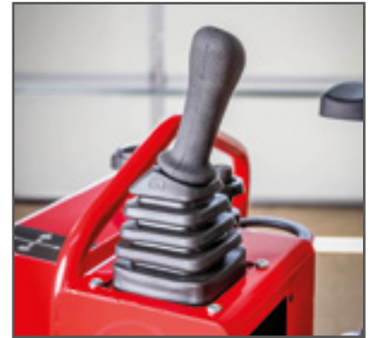
Power steering control system to increase maneuverability.