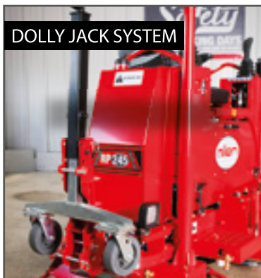
DOLLY JACK SYSTEM

The RP245 riding polisher was designed with the high volume concrete polisher in mind. This riding trowel comes as designed to achieve high rotor speeds to achieve high torque while polishing. It also comes equipped with standard features power steering control and dolly jacks that ensure transportation indoors can be done with ease. This design is also built on our popular edging riding trowel frame to allow contractors to get extremely close to the wall while polishing.