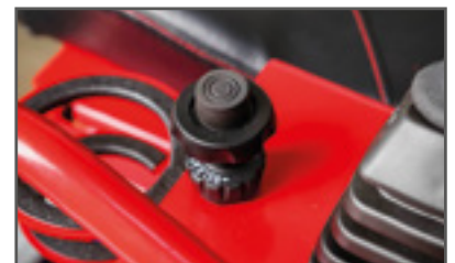
Cruise Control to maintain consistent rotor speed.