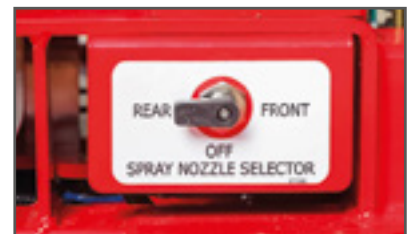
Rear and front spray nozzle selector.