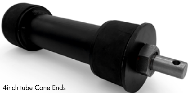
4inch tube Cone Ends

Rotoscreed Cone Ends are available in 6 inch and 4 inch diameter. They slide into the open end tubes and are then tightened to ensure the cone expands inside the roller, this system is ideal for concrete finishing professionals want to quickly remove and attach the same tooling within a selection of tube lengths.