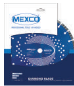
Mexco Diamond Blade product packaging