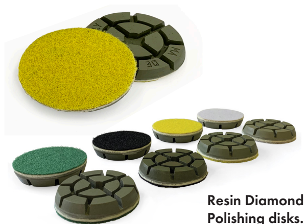
Resin Diamond Polishing disks.